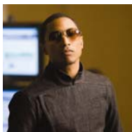
Pharrell Williams Artist & Producer (USA)