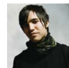
Peter Wentz Musician, Entrepreneur, Activist (USA)