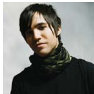
Pete Wentz Musician, Entrepreneur, Activist (USA)