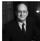
Peter Gelb General Manager The Metropolitan Opera (USA)