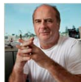
Michael Gudinski Founder & Chairman Mushroom Group of Companies (Australia/New Zealand)