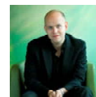
Daniel Ek CEO Spotify (Sweden/UK)