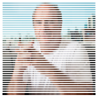
Michael Gudinski Founder & Chairman Mushroom Group of Companies (Australia/New Zealand)