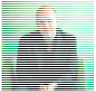
Daniel Ek CEO Spotify (Sweden/UK)