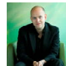
Daniel Ek CEO Spotify (Sweden/UK)