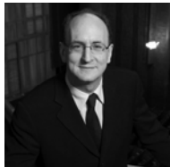
Peter Gelb General Manager The Metropolitan Opera (USA)